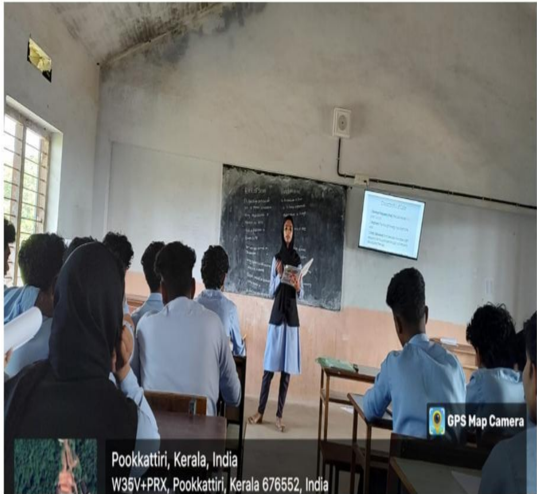
Photo: Student presenting seminar