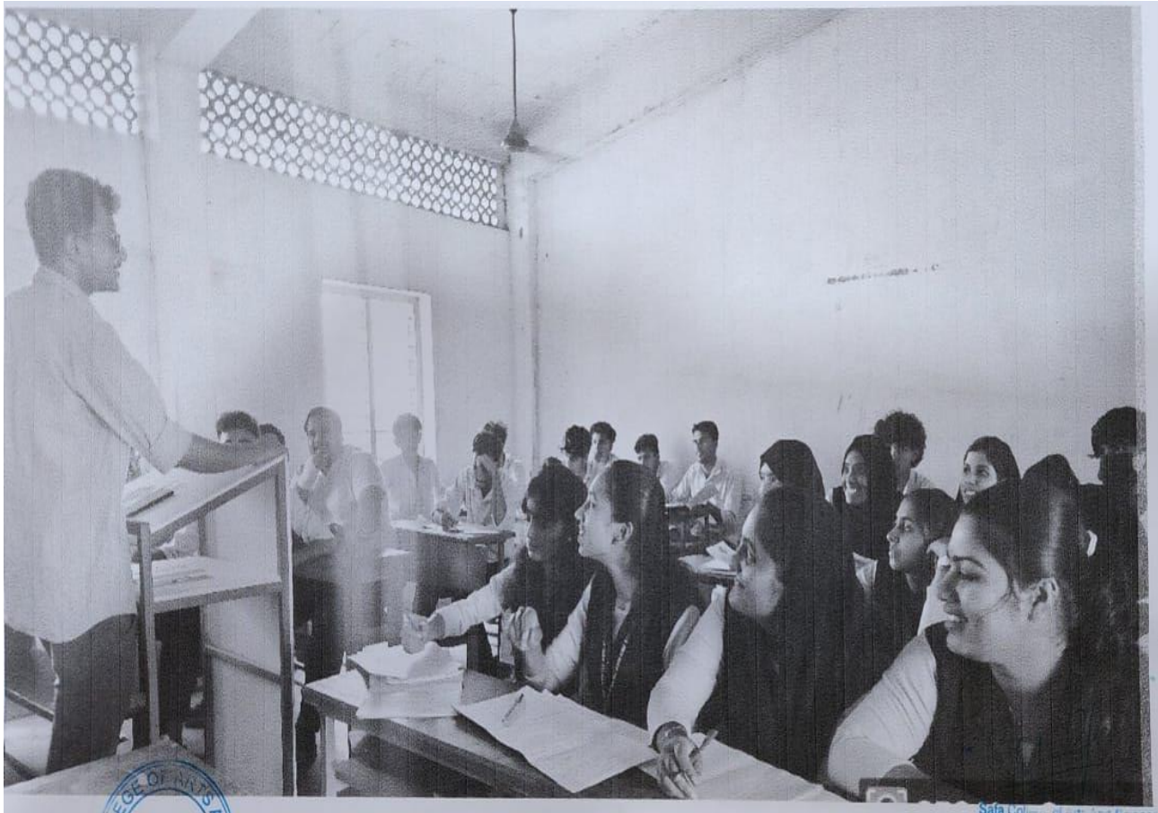
Ozone day physics