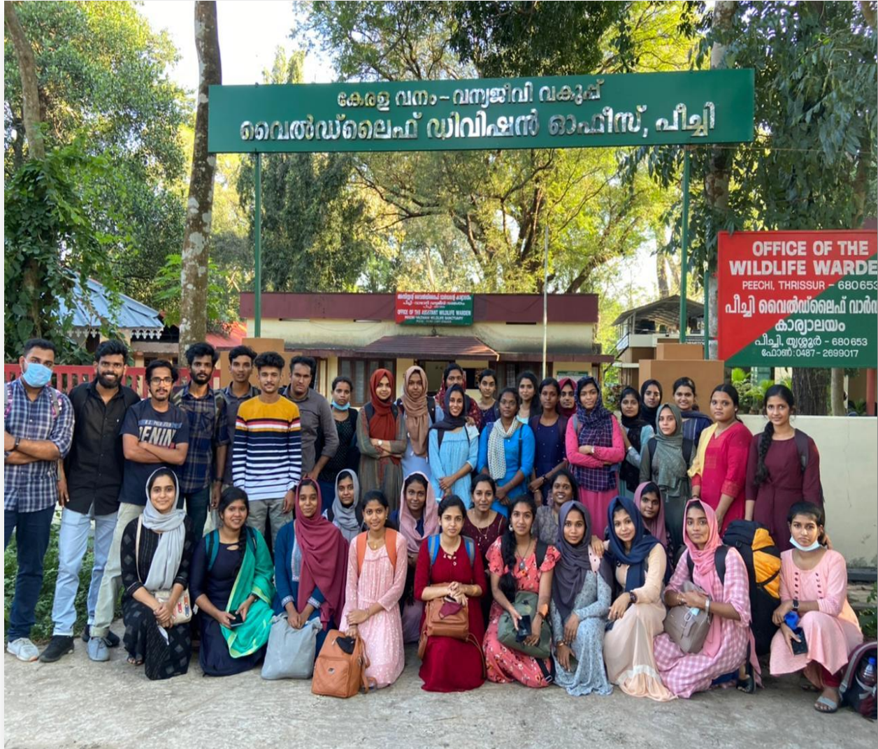
Koottu koodi koodum thedi