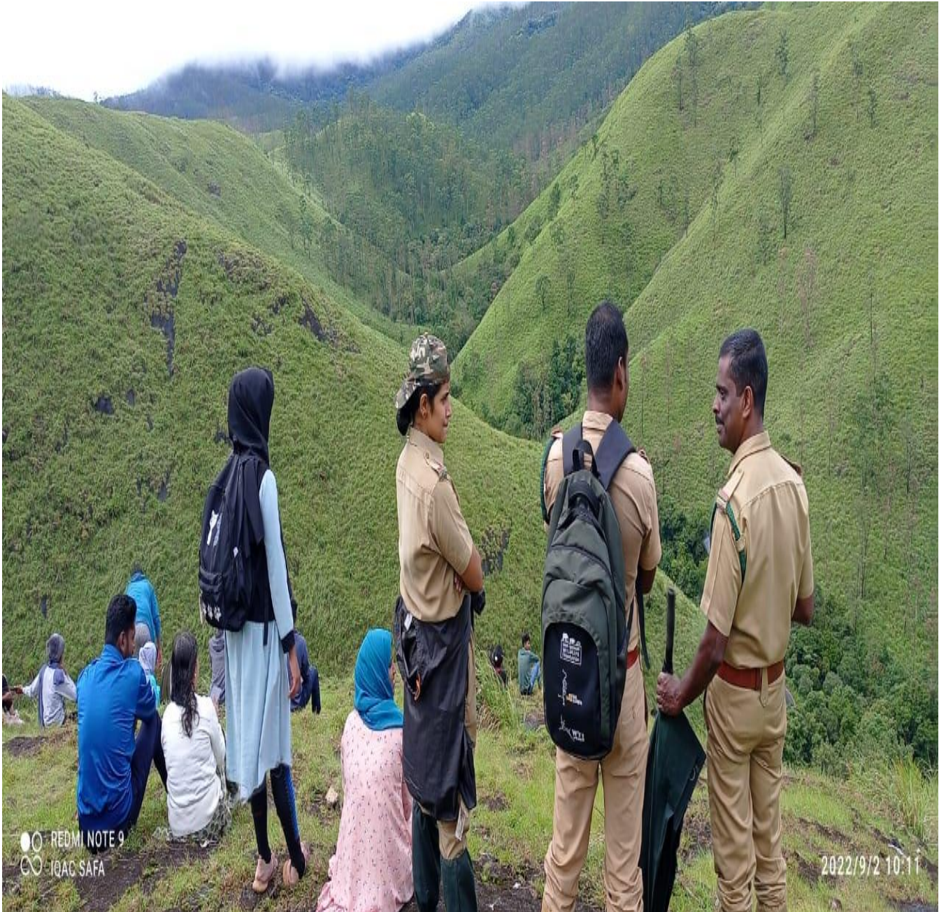
NATURE CAMP AT PERIYAK WILD LIFE